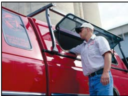
Select a responsible roofing contractor.