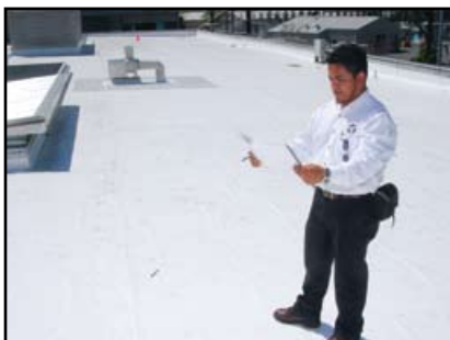
Determine where to spend your first dollar on roofing.