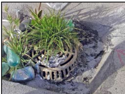
Implement a preventive maintenance program.