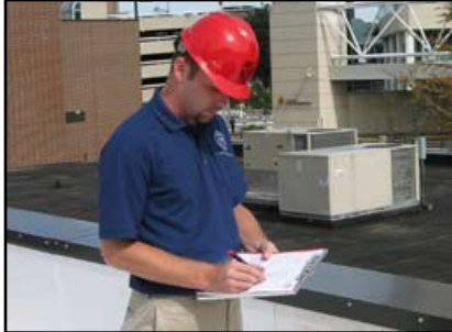
Plan for price increases.